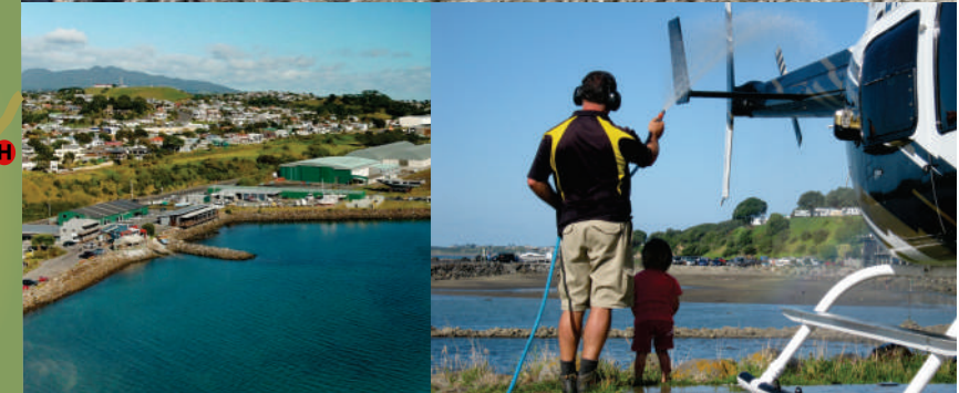
Heliview also provides flights over the Central Plateau from Ohakune.